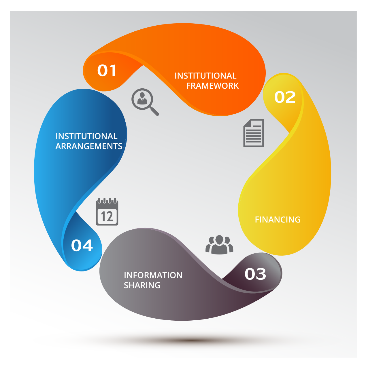
Figure 1: Challenges and Enabling Factors for Private sector Engagement in Climate Change Actions (Source: Source: Crawford & Church, 2019)

The findings of the survey on the barriers that prevent the private sector from investing in climate change solutions indicate many private sector actors have limited capacity to handle climate change issues, they have limited information, perceive government incentives as inconsistent, many feel the environment is not business friendly and have limited or no access to financing as shown in Figure 2 below.